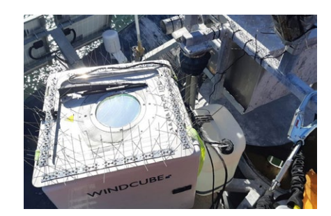
WindCube Offshore on a fixed platform.

As a result, Leosphere, a Vaisala company, is the iconic and trusted gold standard in wind lidar. Our turnkey WindCube product suite offers innovative, reliable, and highly accurate solutions for thousands of customers across the globe. All of this has enabled us to be catalysts for change and ambassadors for wind energy, always advancing the field and those we serve.